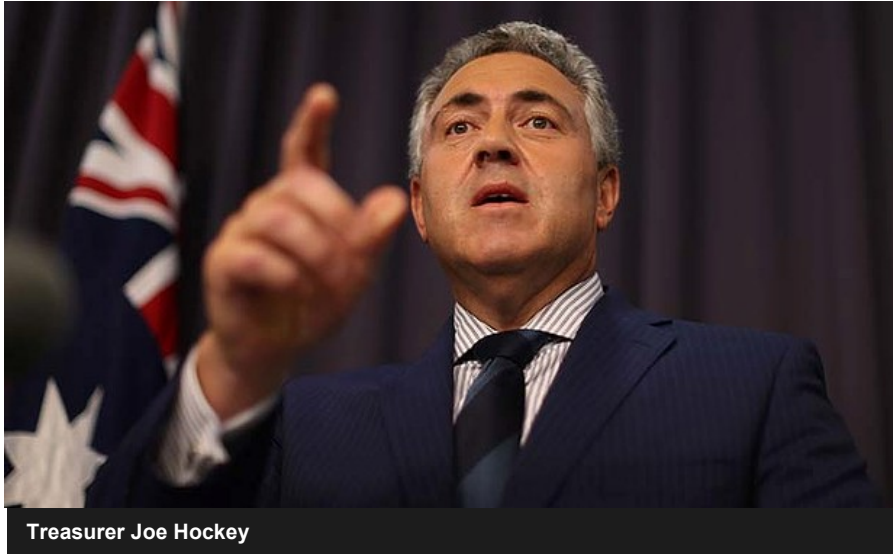
Treasurer Joe Hockey